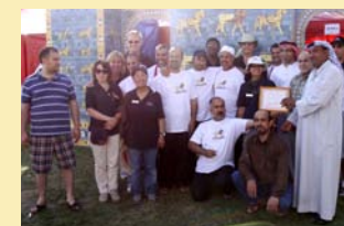
1 st Iraq