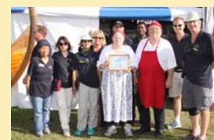
2 nd Scandinavia