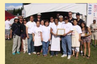
3 rd Lao