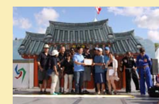
2 nd Korea