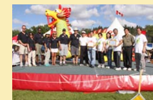
3 rd Chinese