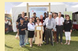
3 rd Ukrainian