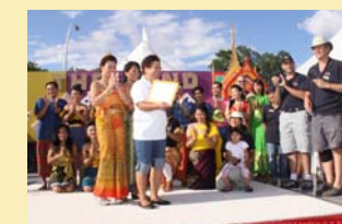
1 st Thailand