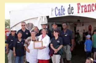
1 st France