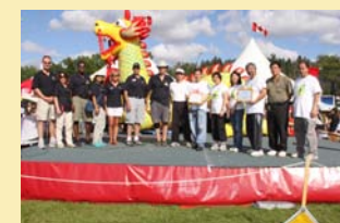
2 nd Chinese